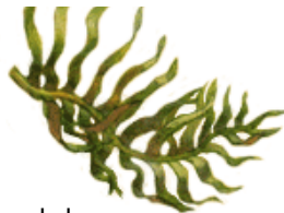
Art © 2005 Ponder Goebel